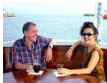
Lido Deck Relaxation