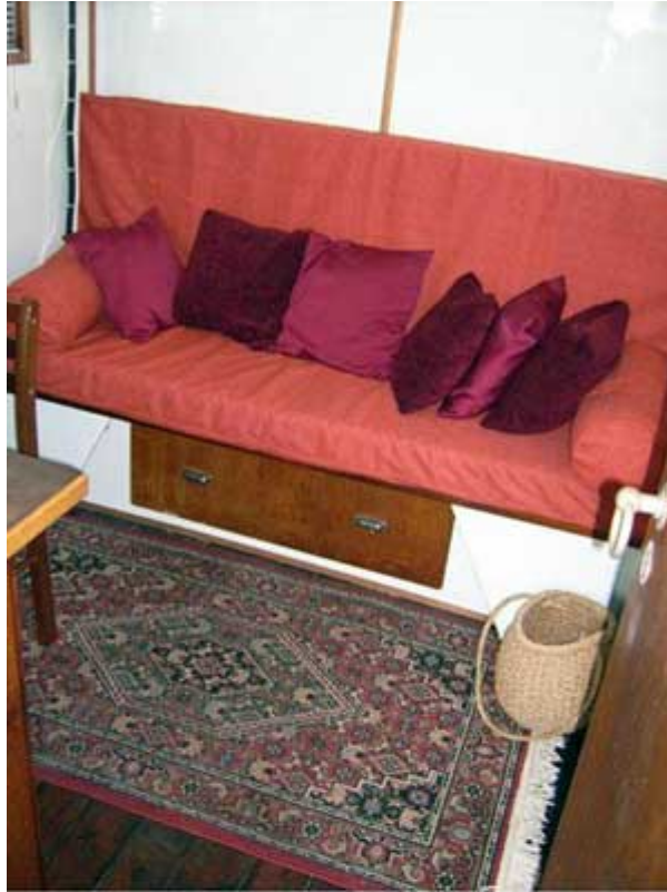
Air Conditioned Library