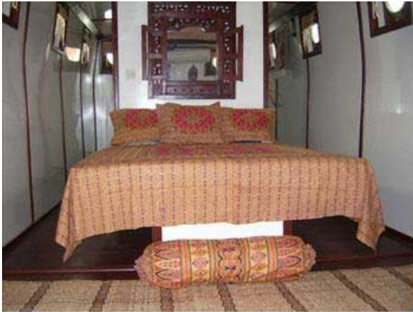
Queen size bed