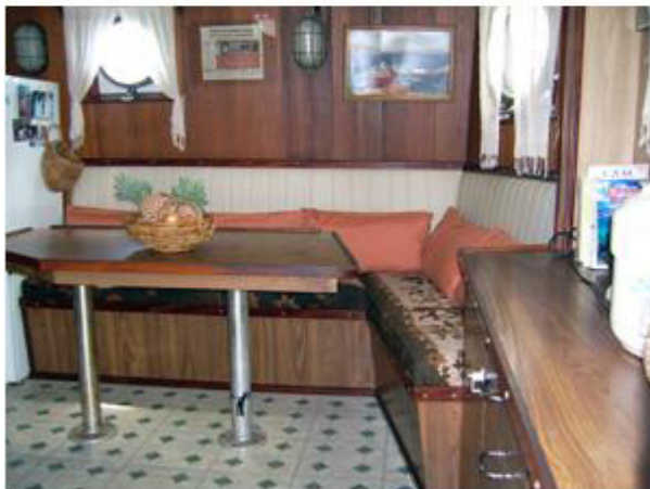
Indoor Dining Area used during squally weather.

2005 Rework: Constructed owners cabin, total exterior paint, new electronics, complete reconstruction of Lido Deck with sun shade, added new diesel tanks, added 6 kw Lister generator, complete rebuild 10 kw Lister generator, Complete reconstruction 240v electrical systems including replacement of all electrical devices to energy saving or passive type models (power requirements are a small fraction of comparable vessels), rebuilt Captain's Day room (ship library), added water maker, added 5 kw emergency generator, added redundant engine room systems.