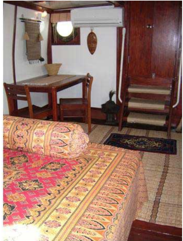
Cabin dining or working area